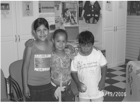
Children served by the Monument Crisis Center enjoying Third Anniversary Celebration